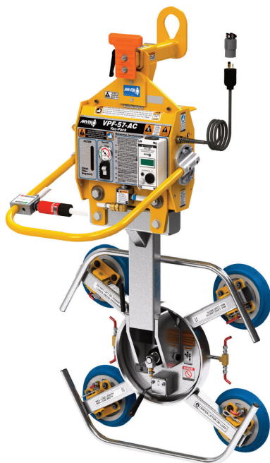
Without Pad Extensions